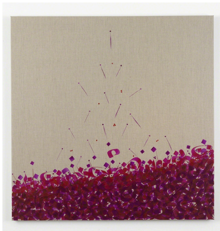
Pouran Jinchi Wound 4 , 2015 Leila Heller Gallery

Jinchi's process involves pulling fragments of Farsi calligraphy from original texts and then transforming individual characters and accents into abstract, evocative shapes and patterns. "I am fascinated by the power of language, which can enable communication but also create barriers of understanding," Jinchi recently told Artsy. "My first encounter with calligraphy was as a child, and I took a great interest in it growing up in Iran. There is something very mathematical and expressive about calligraphy."