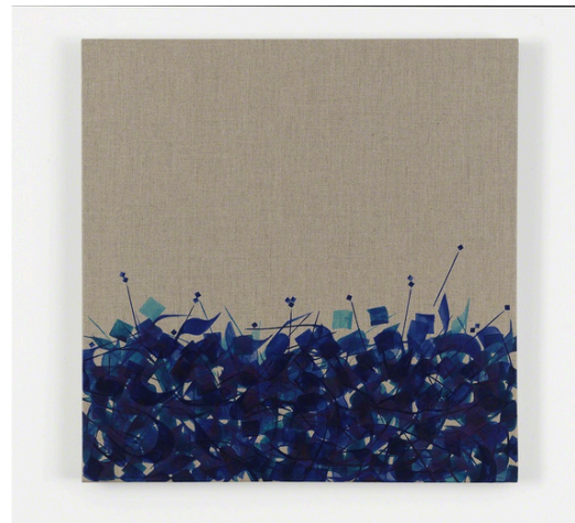
Pouran Jinchi Sores 1 , 2015 Leila Heller Gallery