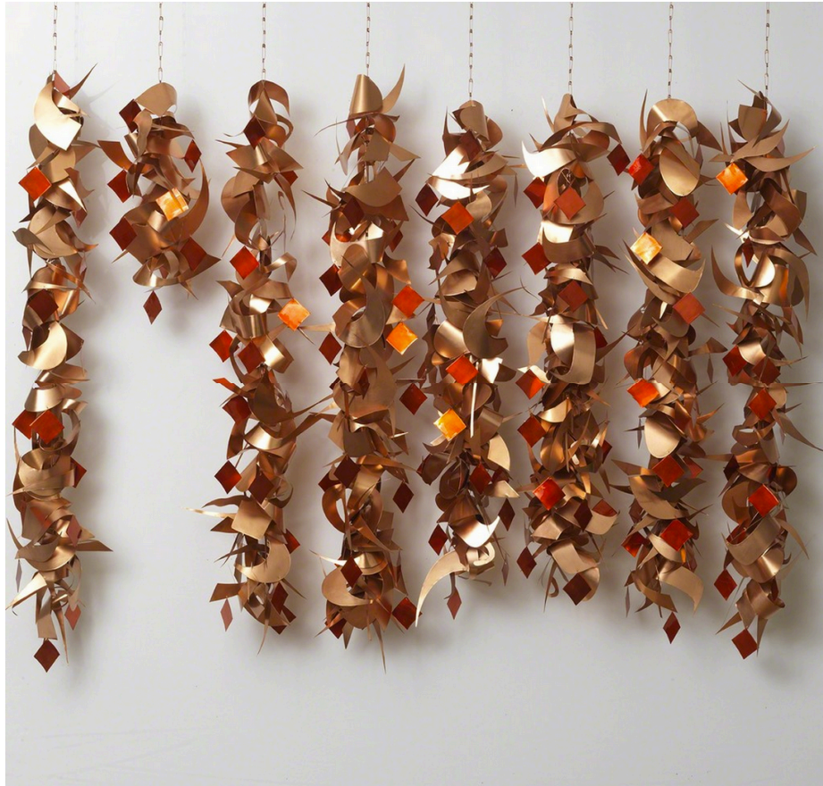
Pouran Jinchi Hanged series , 2015 Leila Heller Gallery

Jinchi's process involves pulling fragments of Farsi calligraphy from original texts and then transforming individual characters and accents into abstract, evocative shapes and patterns. "I am fascinated by the power of language, which can enable communication but also create barriers of understanding," Jinchi recently told Artsy. "My first encounter with calligraphy was as a child, and I took a great interest in it growing up in Iran. There is something very mathematical and expressive about calligraphy."