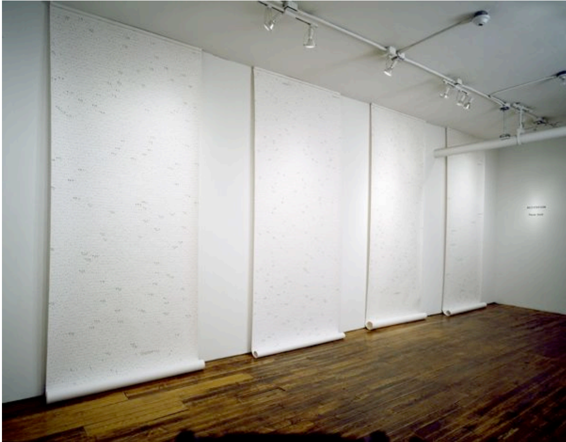
Gallery Installation M.Y. Art Prospects, New York, May / June 2006