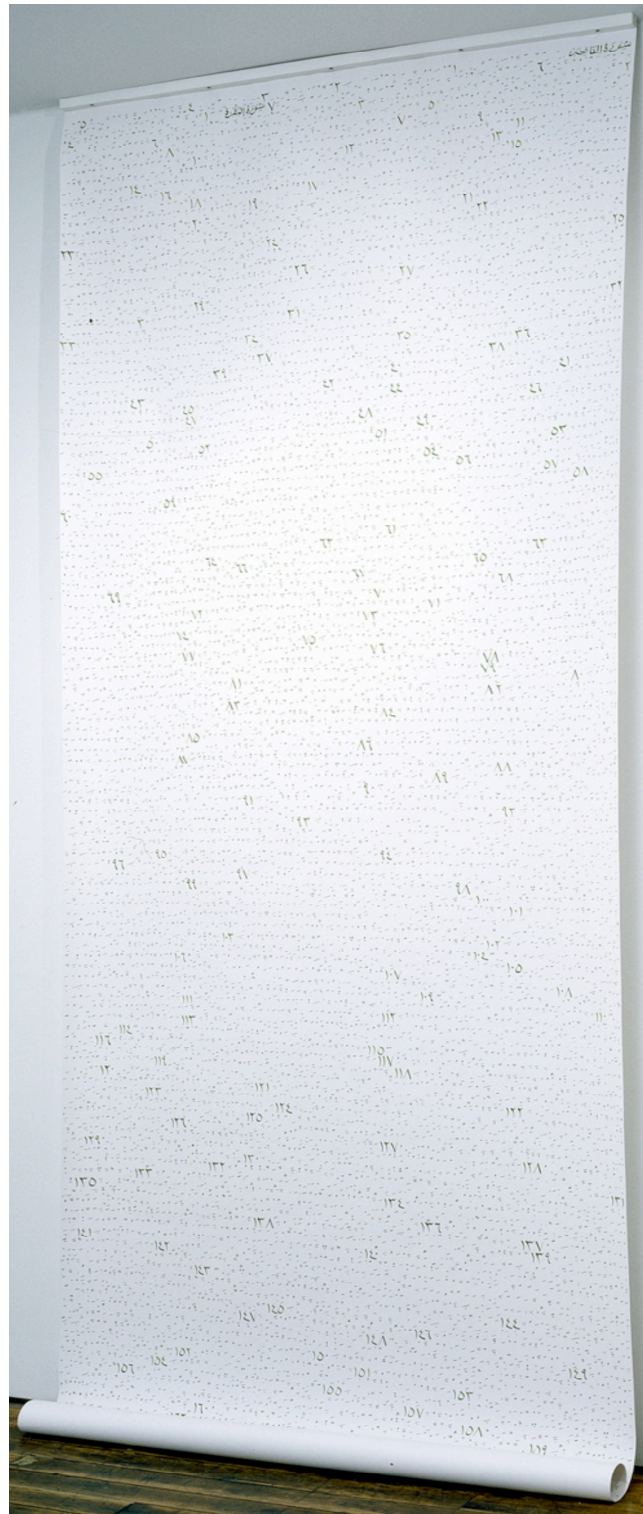
Gallery Installation M.Y. Art Prospects, New York, May/June 2006

Interval(le)s II.2-III.1 (Fall 2008/Winter 2009)