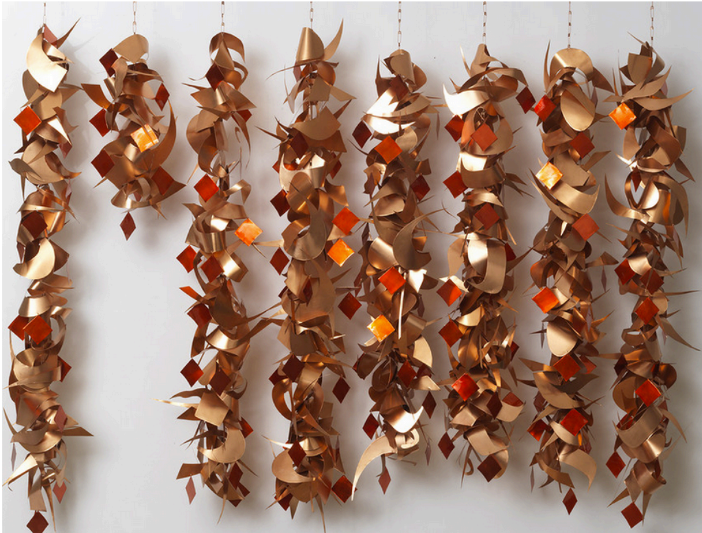
Jinchi Pouran, Hanged , detail, 2015, copper, 7w in

17 Sep — 24 Oct 2015 at Leila Heller Gallery in New York, United States